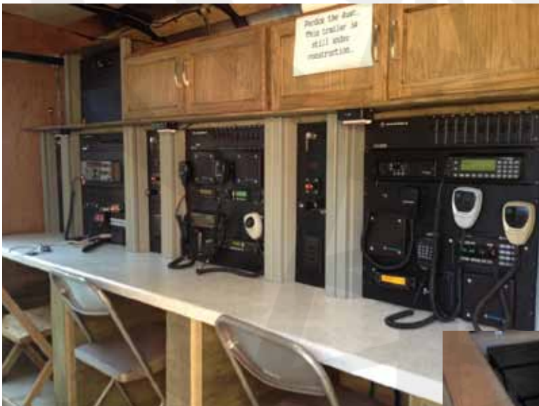
To the left, the trailer accommodates three operators and the equipment is rack mounted.

With the addition of our new trailer, our club is now beginning to thrive again. With West Mountain's outstanding products we able to create a DC distribution system that are not only rock solid, but safe. With the Super PWRGate's we will get the maximum life out of our Gel Cell Batteries and never overcharge them. The RIGblaster Advantage allows us to work all the digital modes on HF with very little setup time. We have already used our trailer on two public service events and for ARRL's Field Day. Having the trailer made setup and tear down a whole lot easier than years past. Lastly we now have place to proudly display our original charter that was issued in 1947 from the ARRL. For more information on CARC please visit us at www.qsl.net/w8bhz .