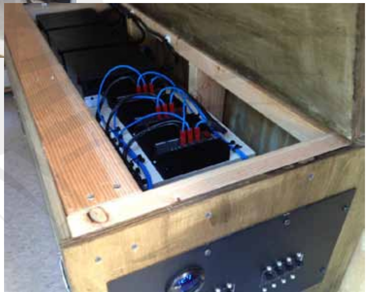
To the right, the battery bank consists of (4) 70AH Gel Cells. Each employs the use of West Mountain's Super PWRGate PG40S and is fed with a 35A Switching supply.