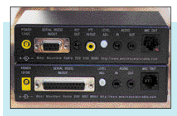
Rear view of the RIGblaster (bottom) and RIGblaster Plus (top) show additional jacks added on the Plus version. See text for details.

you hook up to the same "Com" port on your computer that you have configured to communicate with the RIGblaster.