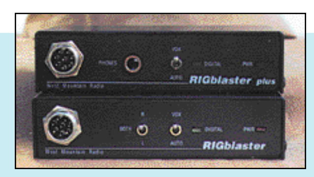
The RIGblaster (bottom) and RIGblaster Plus (top) from West Mountain Radio. See text for differences in features between the two models.

*Editor, CQ e-mail: <w2vu@cq-amateur-radio.com>